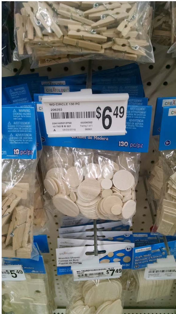
Figure 3: Wooden disks at Michael's arts & crafts store